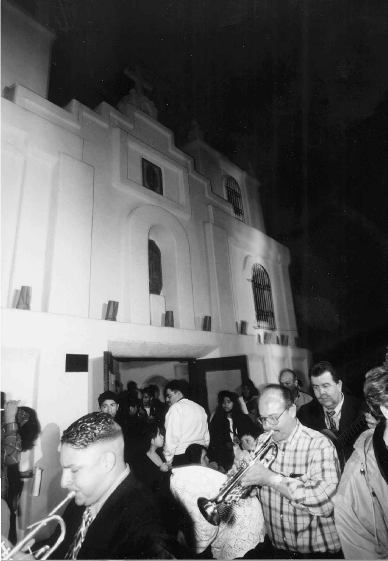
12. In front of Our Lady of Guadalupe Church, neighborhood musicians lead the posada following the community performance of La Pastorela.