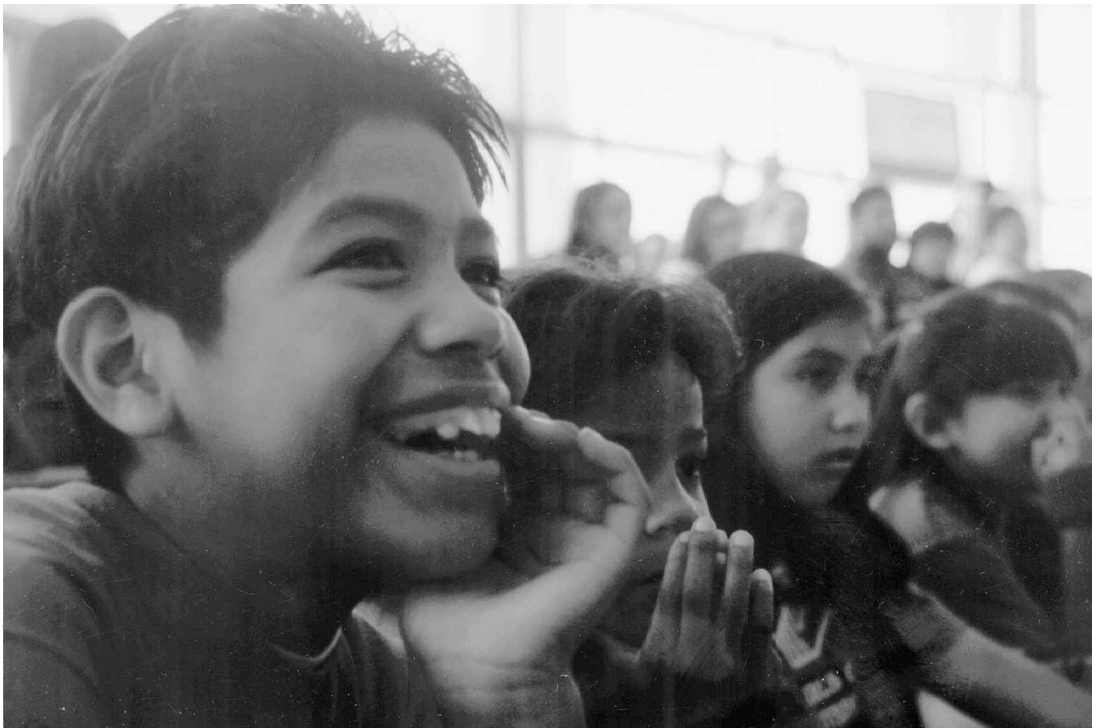
18. Students from Sierra Vista Elementary School watch a performance at Grady Gammage Auditorium, 11 April 1999.

Like many adolescent organizations, we need to think creatively about the management, administration, and governance practices that support our artistic work. The AFP has always focused its energies and resources on projects, and now we're in the position of increasing our organizational capacity to support the work at new and more demanding levels. We're learning how to take advantage of new technology in our communication strategies. We're redefining our concept and expectations of documentation. We're adding staff, and utilizing interns from the Antioch College Cooperative Education Pro-