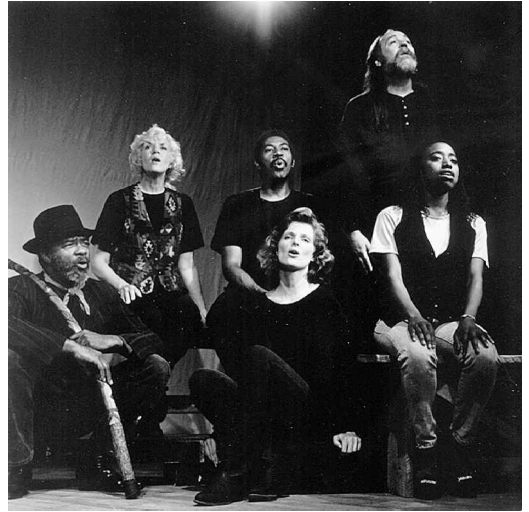
2. Artists of Junebug Productions and Roadside Theater in their play Junebug/Jack , performed at Grady Gammage Auditorium, Phoenix, 9 April 1999.

This deep thinking about how artists move in the world also arose from some very practical consideration for these small artistic companies, for instance, Roadside Theater from Appalachian Kentucky. Roadside had become