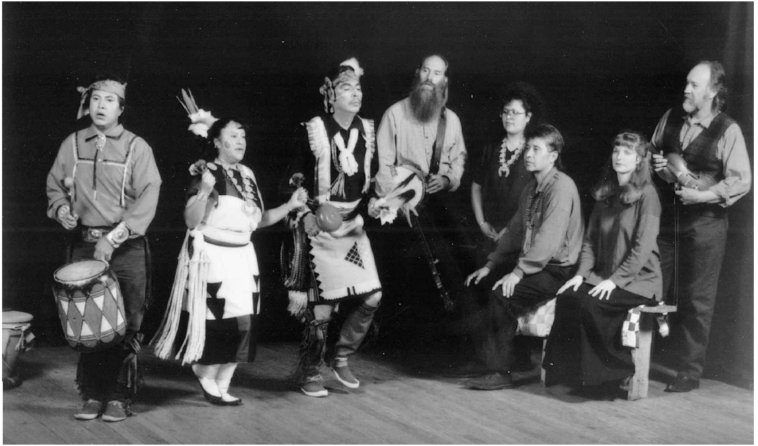
3. Artists of Idiwanan An Chave and Roadside Theater in their play Corn Mountain/Pine Mountain , performed at the Empty Space Theater , Tempe, Arizona, 14 February 1998, and at Grady Gammage Auditorium in Phoenix on 11 April 1999.

an essential participant in the self-discovery of their own rural place, the coal fields of the Cumberland Plateau, where they are part of the legendary Appalshop cultural center. Roadside's original musical theatre works are drawn from the history, character, and social struggles of the people of Appalachia. Their goals, like Appalshop's, were the perpetuation of cultural heritage, and collaboration with the community to create a contemporary cultural identity linked to progressive social change. The Plateau's—and the central Appalachian region's—relationship with their artists is a grassroots partnership based in ongoing dialogue via live performance, film, video, music recording, printed word, and a continuously broadcasting radio station. 2