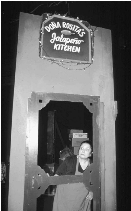
6. El Teatro de la Esperanza's production of Do a Rosita's Jalapeño Kitchen at Grady Gammage Auditorium, March 1998.

For Untold Stories , Idiwanan An Chawe worked at St. Peter Indian Mission School, a Catholic school on the Gila River Reservation, serving the Pima Indian tribe. The Zuni artists included young teenaged dancers who performed their traditional dances for