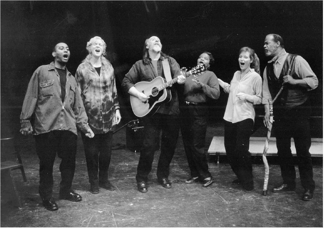
16. Members of Roadside Theater and Junebug Productions in Junebug/Jack, a piece created over the past 10 years with the hope of sharing each other's audiences—one predominantly white, the other predominantly black—both economically hard-pressed.