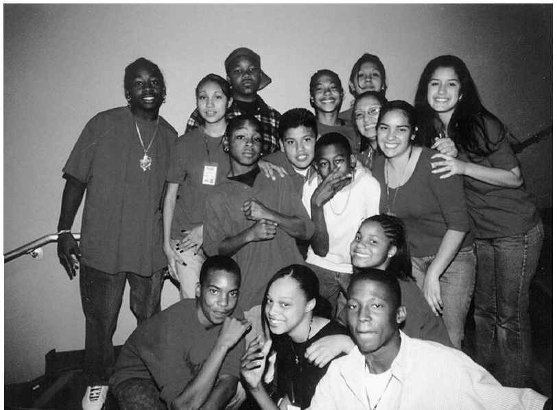
5. Students from Sierra Vista Elementary School who participated in the Untold Stories festival, Grady Gammage Auditorium.