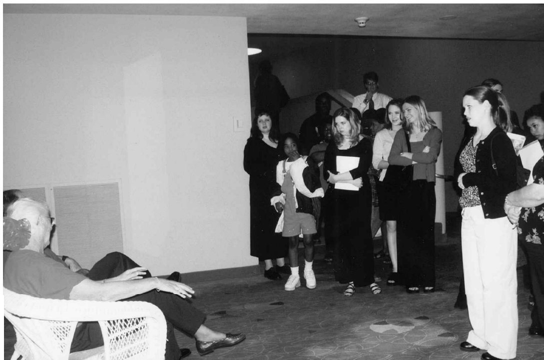
13. Audience members listen to members of The Entertainers , an amateur performance group in Phoenix's Ahwatukee retirement community along The Gammage Tour.

cuss differences and similarities in communicating with the diverse communities she worked with in the project: