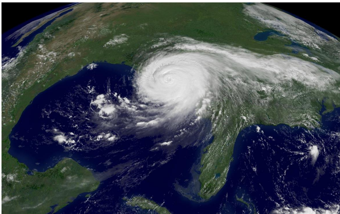
Fig. 3. Category 5 Katrina hurricane.

Fifth, Moses included birds to be put on Noah's ark because the storm that would have produced the flood must have been at least a category 5 hurricane with winds in excess of 156 mph like that of hurricane Katrina that hit Texas and Louisiana. No birds could have survived such strong winds ( Fig. 3 ).