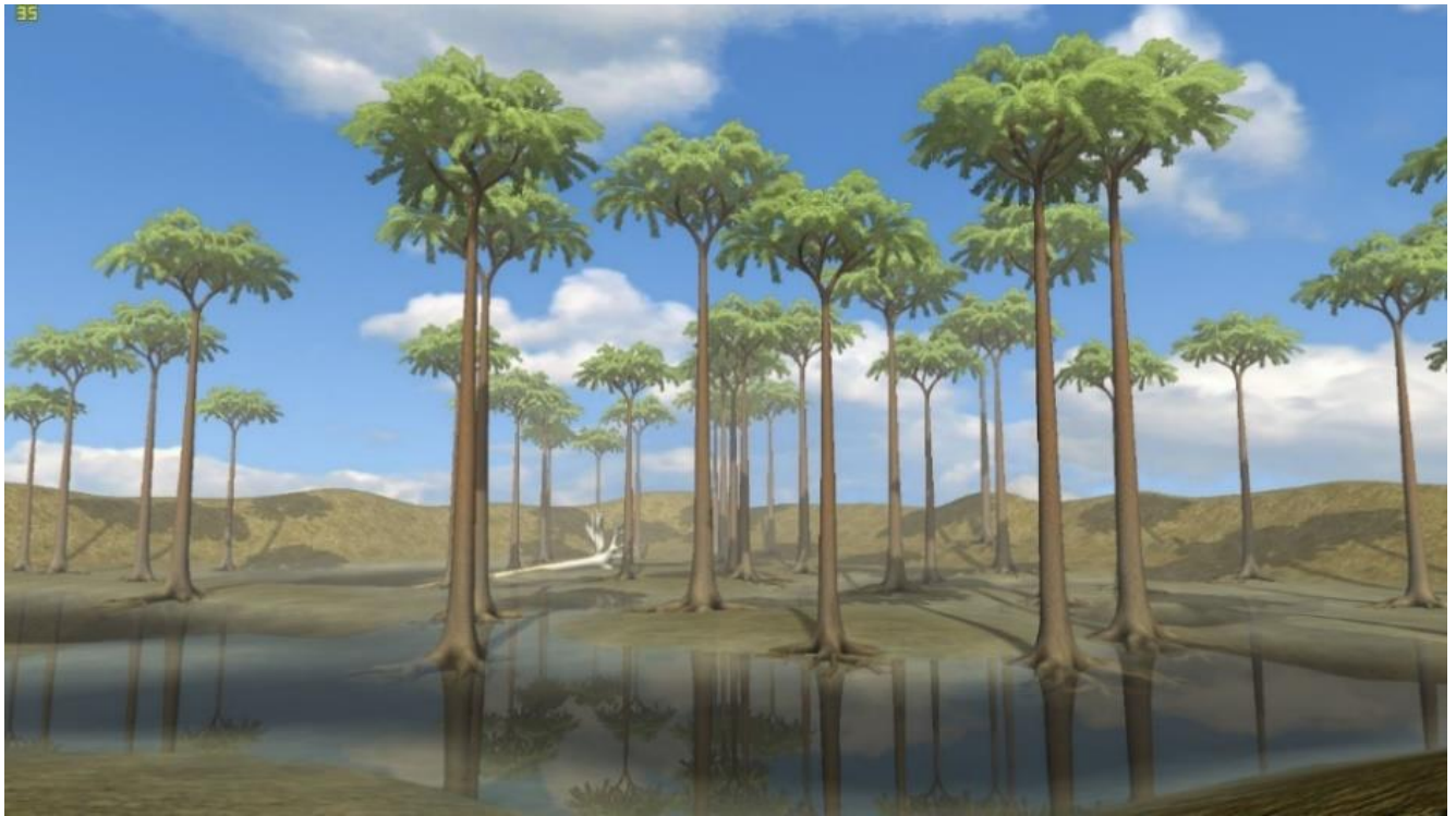
Fig. 1. Lepidodendron trees.

In today's world we need to use wisdom and to recognize that Moses was inspired by God but was not trained in modern science. For example, large amounts of coal deposits occur in the world that would require the rapid covering of vast quantities of vegetation. The reason that coal was NOT deposited in the one year of Noah's flood is because fossils of Lepidodendron trees ( Fig. 1 ) have been found that became as tall as 100 feet in successive 13 coal layers of Mississippian and Pennsylvanian ages (mid-Noah's flood time of one year) that overlie each other ( Fig. 2 ).