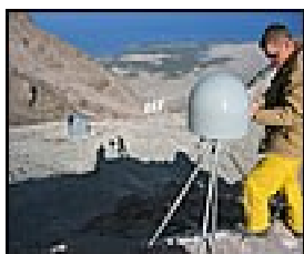
GPS receiver installation

Professional geologists in industry, education, and research are particularly active in the state of California. This course will give you an overview of some of these fields including environmental science, engineering geology, hydrogeology, atmosphere and oceanographic science, earthquake geology and geophysics