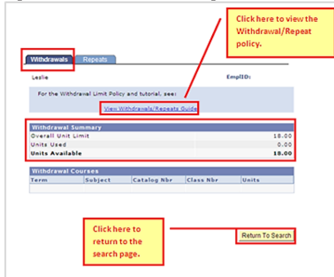
Figure 5 – Withdrawals Tab and Page