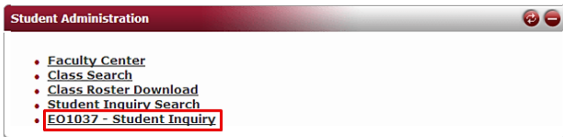
Figure 2 – EO1037 – Student Inquiry Link