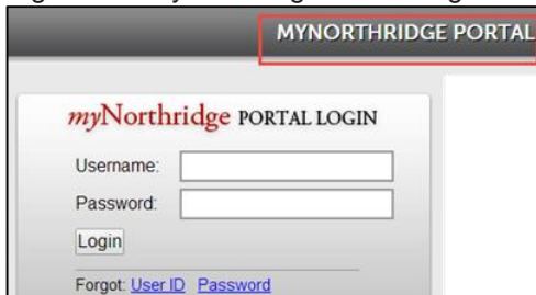
Figure 1 – myNorthridge Portal Login