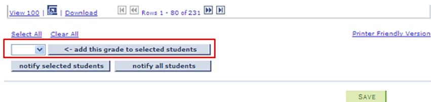
Figure 5 – Grade Roster: Mass Update Option