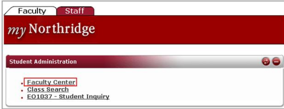
Figure 2 – Faculty Center Link

5. On the Faculty tab, from the Student Administration pagelet, select Faculty Center .