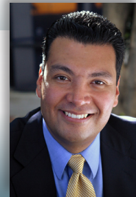
Senator Alex Padilla, Keynote Speaker

1:00 p.m. – 1:30 p.m. Tour of CSUN Campus Fuel Cell Facilities