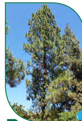
8 Pinus canariensis : Canary Island Pine

The Canary Island Pine is a fast-growing, narrow tree with a distinctive branching structure. It grows 50-80 ft tall and up to 30 ft wide. The characteristic green-gray needles and oval shaped cones make it unique from other pines. The needles grow in bundles of 3, up to 12", and are often bluish when young. Cones grow 4-9" long. It tolerates smog and dust, and is therefore well adapted for urban areas.