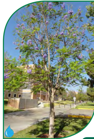
14 Jacaranda mimosifolia : Jacaranda

The Jacaranda is native to subtropical regions of South America, but is highly prevalent in many continents due to its attractive lavender to blue flowers. The 2", trumpet-like flowers can bloom any time during the year, but peak in late spring. The tree can grow 25-40 ft tall with equal, or even greater, spread. The plant contains a powerful healing substance called glutamic acid.