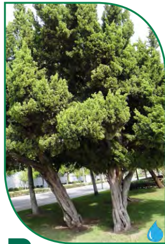
11 Juniperus chinensis 'Torulosa' : Hollywood Juniper

The hardy, slow-growing Lebanon Cedar is one of only 3 species of cedars in the world, and is found between 4000-7000 ft in elevation. The bark is dark gray and fissured, with very thick, long branches. The stiff, dark-green ½-1 ½" needles appear on short shoots and are grouped in tufts of 30-40. It is known for its mythological and scriptural associations. The oldest known tree is over 1000 years old.