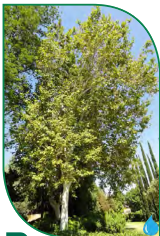
4 Platanus x acerifolia : London Plane Tree

Carob Trees, native to the eastern Mediterranean, can grow up to 55 ft tall and live over 150 years. The leaves are pinnately compound, glossy, dark green, and oval in shape. The flowers have an unpleasant fragrance and are followed by 4-12" brown pods in summer and fall. The pods are filled with pulp and seeds and are processed into a cocoa-like flour, which is high in fiber, and used as a chocolate substitute.