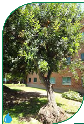
3 Ceratonia siliqua : Carob Tree

The Pepper Tree, native to Peru, can grow 30-40 ft tall. It has gray-colored bark that exfoliates with age, revealing a reddish color underneath. The leaves are 6-12" long, pinnately compound, and linear with 2½" leaflets. It has small, off-white flowers that are followed by small, round, reddish seeds with a strong pepper scent. The tree is considered invasive by the California Invasive Plant Council.