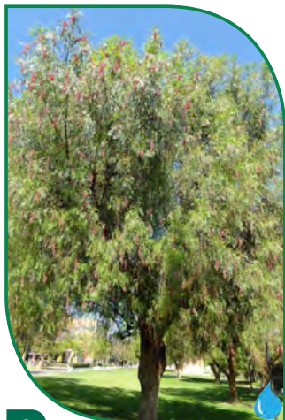
2 Schinus molle : Pepper Tree

The Pepper Tree, native to Peru, can grow 30-40 ft tall. It has gray-colored bark that exfoliates with age, revealing a reddish color underneath. The leaves are 6-12" long, pinnately compound, and linear with 2½" leaflets. It has small, off-white flowers that are followed by small, round, reddish seeds with a strong pepper scent. The tree is considered invasive by the California Invasive Plant Council.