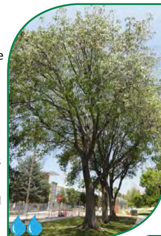
9 Fraxinus uhdei : Evergreen/Shamel Ash

The Shamel Ash, native to Mexico, is a fairly fast-growing tree, which can reach up to 80 ft. The pinnate leaves are divided into 5-9 glossy dark green leaflets, which are about 4" long, toothed and narrow. Its leaflets may burn if exposed to hot winds. Inconspicuous, petal-less flowers grow in large panicles. The tree is dioecious, with male and female flowers growing on separate trees.