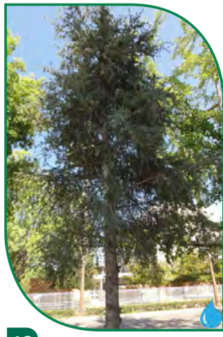
13 Cedrus libani : Lebanon Cedar

The hardy, slow-growing Lebanon Cedar is one of only 3 species of cedars in the world, and is found between 4000-7000 ft in elevation. The bark is dark gray and fissured, with very thick, long branches. The stiff, dark-green ½-1 ½" needles appear on short shoots and are grouped in tufts of 30-40. It is known for its mythological and scriptural associations. The oldest known tree is over 1000 years old.