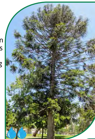
7 Araucaria bidwillii : Bunya Pine

Bunya Pines have deeply furrowed bark and 2 types of leaves. Young leaves are 1-2", glossy, and arranged in 2 rows on branchlets. Mature leaves are ½", oval, spirally arranged and overlapping on branchlets. Female trees produce big, spiny, pineapple-shaped cones every few years. The cones can be up to 9" long, 8" across, and can weigh up to 18 pounds! They are a delicacy to Australian Aborigines.