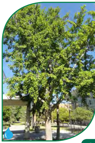
10 Ginkgo biloba : Maidenhair Tree

The Maidenhair Tree is pyramidal, with irregular horizontal branches. The 2-3" emerald-green fan-shaped leaves grow in clusters of 3-5. Plum shaped, yellow-orange fruit grows on the female trees. The outer fleshy pulp and seed kernel are poisonous when ingested in large quantities and lead to minor dermatitis after contact with skin. However, the seed itself is boiled or roasted and eaten in Asia, and is used in traditional medicine.