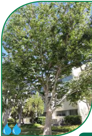
12 Zelkova serrata : Sawleaf Zelkova

The deciduous Sawleaf Zelkova, native to Japan, Taiwan and eastern China, can grow 50-80 ft tall, with equal spread. The bark is smooth and gray when the tree is young, but will reveal the orange-brown inner bark when it gets older. The leaves are oblong, elliptic, and medium-green in color, with coarse, ciliate marginal teeth and acuminate tips, turning from yellow, orange, to brown in fall.