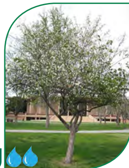
6 Pyrus kawakamii : Evergreen Pear

Bunya Pines have deeply furrowed bark and 2 types of leaves. Young leaves are 1-2", glossy, and arranged in 2 rows on branchlets. Mature leaves are ½", oval, spirally arranged and overlapping on branchlets. Female trees produce big, spiny, pineapple-shaped cones every few years. The cones can be up to 9" long, 8" across, and can weigh up to 18 pounds! They are a delicacy to Australian Aborigines.