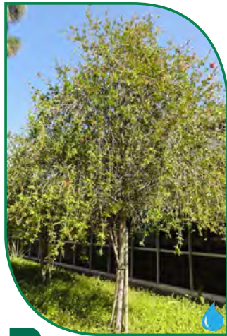
15 Callistemon citrinus : Lemon Bottlebrush

The Lemon Bottlebrush, native to Australia, can grow 6-12 ft tall and 6-9 ft wide. The tree is often multi-trunked with rough, brown bark and gray, drooping branches that have thorns. The 6" bright-green, elliptic and leathery leaves have a distinct citrus aroma when crushed. Bright red flowers, mostly made of stamens, are arranged in fuzzy clusters resembling the bristles on a brush used to clean bottles.