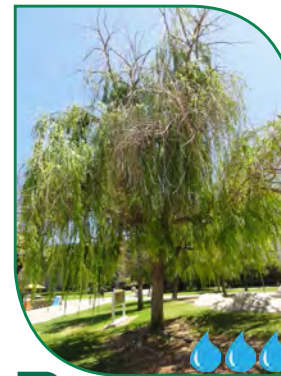
1 Salix babylonica : Weeping Willow

The Weeping Willow is a rapidly growing deciduous tree with a short life-span, that can reach 30-50 ft in height. It has a short trunk, broad rounded crown, and pendulous weeping branches with 3-6" alternate, narrow, simple leaves. It has a very invasive, shallow root system, so it is best to avoid planting near sewers or water lines.