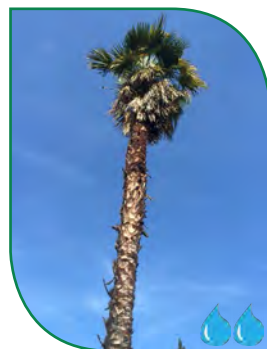
5 Trachycarpus fortunei : Windmill Palm

The Windmill Palm, one of the most cold-hardy palms, is native to Asia. The 3 ft in diameter palmate leaves are light to dark green above and silvery below. They are held on thin, toothed, flattened stems, that are about 3 ft long. It grows 20-40 ft tall with a 8-10" diameter trunk which is wider at the top.