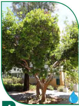
4 Arbutus unedo : Strawberry Tree

This evergreen shrub to small tree is often multi-stemmed with a round, dense shape, and can grow 20-25 ft tall, with an 8-15 ft spread. The Strawberry Tree has dark red-brown, flakey bark. The simple 2-4" long leaves are oblong with toothed margins. They are dark green in color but have red stems. The fruit is used to make jams, beverages and liquors.