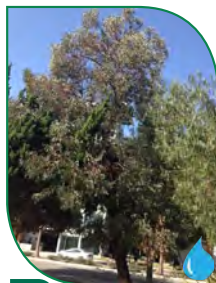
20 Eucalyptus sideroxylon 'Rosea': Red Ironbark

The Red Ironbark, a fast-growing tree native to Australia, can grow up to 60 ft. It has deeply furrowed, reddish-black bark and 4" blue-green leaves that are slightly sickle-shaped. The pink-red flowers are produced in winter when many other trees are dormant, and can be a food source for many insects.