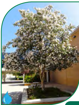
Lagerstroemia indica 'White': White Crape Myrtle 12

The Crape Myrtle, native to China, needs full sun exposure and infrequent watering. It can grow up to 40 ft and is often multi-stemmed. The smooth bark exfoliates, exposing multiple colors. The alternate or opposite dark-green leaves are elliptical and 1½-2" long. The showy flowers range from white, lavender, pink to purple