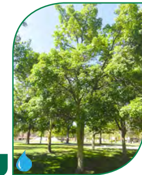
7 Ceiba speciosa : Silk Floss Tree

The Silk Floss Tree is native to tropical and subtropical regions of South America. The bark of young trees is green due to chlorophyll, which enables the tree to photosynthesize even when leaves are absent; with age it turns gray. The trunk is studded with conical thorns which store water.