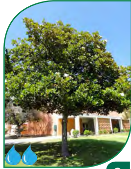
3 Magnolia grandiflora : Southern Magnolia

The large, broad-leaved Southern Magnolia typically has a straight trunk, 2-3 ft in diameter. It has 5-10" leathery leaves that are dark-green and glossy, simple and alternate, and fuzzy on the underside. The showy, fragrant, creamy-white flowers grow 8-12" and bloom in summer to early fall. This evergreen tree is native to the southeastern United States.