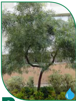
2 Rhus lancea : African Sumac

The African Sumac is a small evergreen tree with rough bark that is gray with red-brown fissures. It produces medium to dark-green, compound leaves divided into three long leaflets (2-3" long), which hang loosely from the branches. It grows from 15-30 ft in height with equal spread. The tree grows best in full sun and heat, and is very drought-resistant once established.