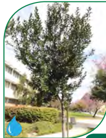
Laurus nobilis: Sweet Bay 19

The Sweet Bay, native to the Mediterranean, is known for its 4" dark green, aromatic, lanceolate leaves that are used as seasoning (bay leaf). In spring, it has clusters of yellow-green inconspicuous flowers and small, ½-1" diameter, lustrous black berries. Its essential oils are also used as food flavoring.