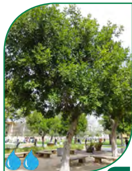
5 Cupaniopsis anacardioides : Carrotwood

The Carrotwood, named for its orangey-red wood, originates from Australia, Indonesia and Papua New Guinea. It is a fast-growing evergreen tree which can reach 30 ft in height. It has large, compound leaves composed of 4-10 leathery, oblong leaflets about 4" long. It requires full sun and is drought tolerant, though it has no trouble with wet soils either.