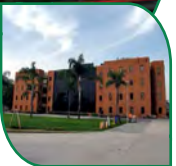
Santa Susana Hall

This walk starts and ends by the B3 parking structure and takes you through some charming courtyards. The walk also passes by Santa Susana hall, home to the Institute for Sustainability. The walk is 0.69 miles long. For more information on the trees in this brochure and a glossary of terms, scan the QR code below.