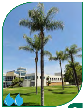
8 Syagrus romanzoffiana : Queen Palm

The Queen Palm is a hardy, single-trunk evergreen tree, which grows up to 50 ft. It is a tropical/sub-tropical species, but can tolerate less frequent watering. It can also withstand temperatures as low as 25° F. It does not like high winds due to its shallow root system. The flowers are white to cream and turn into orange, 1" oval dates that are edible and popular with birds.