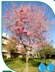
18 Tabebuia rosea: Pink Trumpet Tree

The Pink Trumpet Tree is native to Central and South America. It can reach 15-25 ft tall with a 10-15 ft spread. The bark is gray and furrowed, the branches irregular, and the foliage is pale-green to silver. The pink or yellow flowers are made of 5 petals fused at the base in the shape of a funnel.