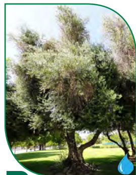
15 Olea europaea: Olive Tree

The Olive Tree is native to the Mediterranean and is the main source for olive oil in the region. Young trees have a smooth, gray bark, which becomes gnarly with age. The 3" leaves are elliptical to lanceolate, dark gray-green above and silvery beneath. Small white, flowers bloom in spring, followed by 1-1½" olives. It reaches 25-30 ft tall.