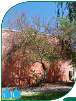
Bauhinia variegata: Purple Orchid Tree 14

The Purple Orchid tree grows 20-40 ft tall, and 10-20 ft wide. The light-green leaves are 4-6" across and rounded with lobed ends that resemble a cow's hoof. The fragrant flowers are 3-5" across, have 5 irregular, slightly overlapping petals and range from purple to lavender to magenta. The flowers are followed by 12" flattened, brown, woody pods.