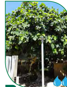
11 Ficus auriculata : Roxburgh or Elephant Ear Fig

The Elephant Ear Fig is native to India and Southeast Asia and grows 15-25 ft. Its large leaves have a sandpaper-like texture, are broadly oval and about 15" across. Young leaves are mahogany red, then turn a rich green when they reach their full size. Large pear-shaped figs, more ornamental than edible, grow in clusters on the trunk and branches.