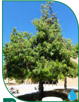
13 Brachychiton populneus: Bottle Tree

The Bottle Tree or "Kurrajong" is native to Eastern Australia and grows 30-40 ft tall, with a 30 ft spread. The simple, 2-3" lanceolate leaves are glossy green and have variations in margin type. Its small, white, bell-shaped flowers with pink dots bloom in early summer, and are followed by a brown boat-shaped pod containing round, fuzzy seeds.