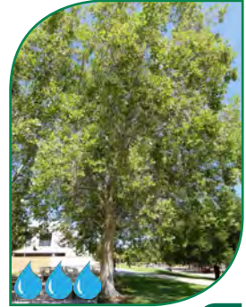
10 Platanus occidentalis : American Sycamore

The American Sycamore has a very distinct bark, which peels off in large flakes, revealing a multi-colored mottled pattern. The rapidly growing tree can reach up to 80 ft tall and 60 ft wide in urban conditions, and larger even in the wild. The alternate, 3 to 5 lobed leaves with incised margins are about 6" long and resemble large Sugar Maple leaves.