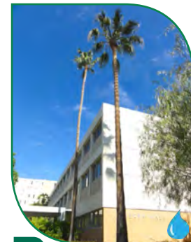
1 Washingtonia robusta: Mexican Fan Palm

The Mexican Fan Palm is one of the fastest growing palms, reaching 75-100 ft tall with a frond spread of 10-12 ft. The smooth, narrow trunk is only 12-14" in diameter and thus the palm sways in the wind. The bright green, palmate leaves are 3-4 ft wide. The 3 ft petiole is reddish-brown and armed with yellow-green spikes.