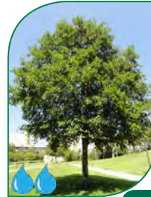
Alnus rhombifolia: White Alder 17

The White Alder is a fast-growing deciduous tree native to North America that can reach 50-75 ft in height, with a 30-40 ft spread. The dark-green glossy, oval leaves are 4" long with serrated edges and appear right after springtime's display of 6" yellow catkins, followed by brown, cone-like fruit.