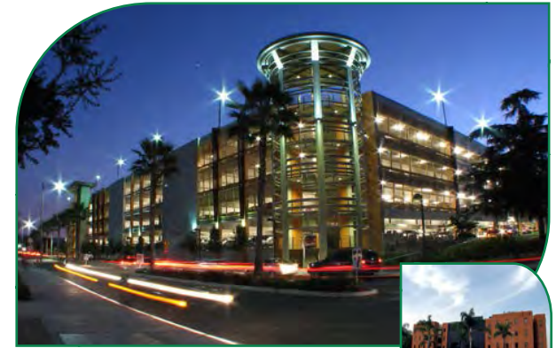
B3 Parking Structure