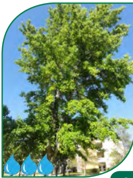
Liquidambar styraciflua : Sweetgum 12

The fast-growing, deciduous Sweetgum is native to the US, Mexico and as far south as Nicaragua. The simple leaves are glossy-green, with 5 deep lobes resembling a star shape. In fall, the foliage turns red and purple, even without cold temperatures. The tree is regarded for its ability to fix nitrogen in the soil, provide shade and resist insect attacks.