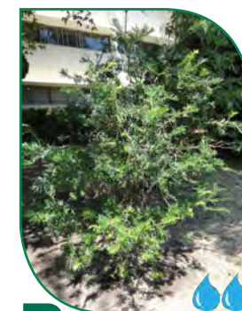
11 Taxus brevifolia : Pacific Yew

The slow-growing, long-lived Pacific Yew is a small evergreen understory tree with an indistinct growth form. It rarely reaches 50 ft in height. It is native to the Pacific Northwest, but due to over-harvesting it is now endangered. It contains poisonous alkaloids known as taxanes and was the original species used to make the chemotherapy drug Taxol.