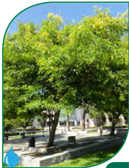
3 Tipuana tipu : Tipu Tree/Rosewood

The Tipu Tree has a dark-brown to streaked-gray single trunk that produces a red sap when wounded. It has yellow to apricot color, pea-like flowers from late spring to early summer and grows 35-50 ft. It is a tropical tree native to South America, and in very dry locations will require regular watering. In more moderate areas, it is drought-tolerant.