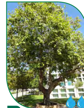
1 Platanus racemosa : California Sycamore

The California Sycamore has a stout trunk with mottled-white bark and can grow to 75 ft tall. The leaves are 5-10" long and deep palmately lobed (3-5). It is an important tree for hummingbirds, butterflies and the Western Swallowtail. It is only drought tolerant once established and where there is a high water table, or along the coast.