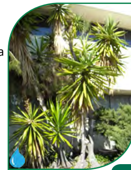
8 Yucca gloriosa : Spanish dagger

This single or multi-trunked evergreen shrub is native to tropical areas of the south-eastern US from North Carolina to Florida. It can grow up to 10 ft tall with an 8 ft spread. Its sword-like leaves are 2-3 ft long and 2" wide. In summer, it produces a 6-8 ft spike of fragrant white flowers that are 3" across. Yuccas are only pollinated by the yucca moth.