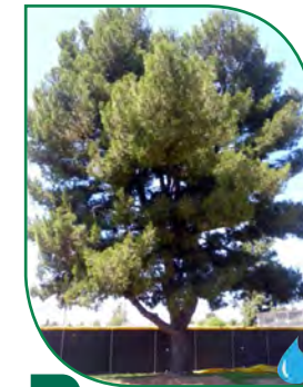
9 Pinus halepensis : Aleppo Pine

The Aleppo Pine is native to the Mediterranean region. It is wind and somewhat drought-tolerant. However, without regular watering, the tree may drop needles. The tree can grow 30-60 ft tall, with a 20-40 ft spread. It has short, fine needles, 2-3" long, growing two per bundle. The resin from the trunk is used for chewing and flavoring wine.