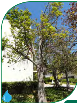
Brachychiton discolor : Lacebark 14

The Lacebark tree is a medium-size tree native to Australia. The bark is gray-brown and ridged. The leaves are ovate to palmately lobed & blue-green in color. The tree blooms in summer or fall after shedding its leaves. The deep-pink flowers are showy, bell-shaped and occur in clusters at the end of the branches. These trees live 50-150 years.