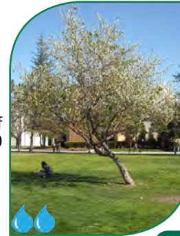
Bauhinia acuminata : Dwarf Orchid Tree 17

Native to Southeast Asia, the Dwarf Orchid is deciduous and grows 6-8 ft tall. The leaves are 4" long, broad & bi-lobed, resembling the hoof of a cow. The large, white, fragrant flowers, appear at the edges of the branches, have 5 petals, 10 yellow-tipped stamens, and a green stigma. Traditional medicine used the bark, leaves, flowers, and roots to treat a variety of illnesses.