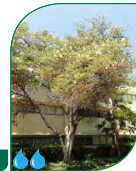
7 Bauhinia forficata : Brazilian Orchid Tree

The Brazilian Orchid Tree is partly deciduous with a rounded, umbrella-like shape. The tree is drought-tolerant, and moderately salt tolerant. It can grow 25-35 ft with an equal spread, and can live up to 150 years. The showy, white flowers are 3-4" wide, and orchid-like.