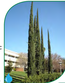
10 Cupressus sempervirens : Italian Cypress

The evergreen Italian Cypress is a columnar, tall, narrow and dense tree, which can grow 40-60 ft in height, with a spread of 10 ft or less. It has dark gray-green needle-like scaly leaves which are aromatic when crushed. It needs full sun and is drought-tolerant once established. The Cypress has been used in classic Italian gardens since the Renaissance.