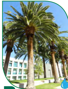
18 Phoenix canariensis : Canary Island Date Palm

Native to the Canary Islands off the coast of northwest Africa, this perennial, slow-growing palm can grow 40-60 ft tall. The massive trunk (4 ft across) is covered with diamond-shaped designs that mark the point of attachment of the leaves. The leaves are pinnate, feather-like fronds, which arch at the top and can grow 15-20 ft long.