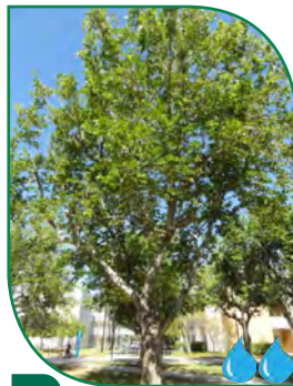
16 Morus alba : White Mulberry

The evergreen Banana Shrub is native to Southeast Asia and India. It has a smooth bark and bright-green, glossy leaves with prominent veins, wavy edges and a finely pointed apex. The heavily scented flowers have 10-20 yellow, orange or cream-colored tepals. The tree was traditionally used to make fragrant hair and massage oils.