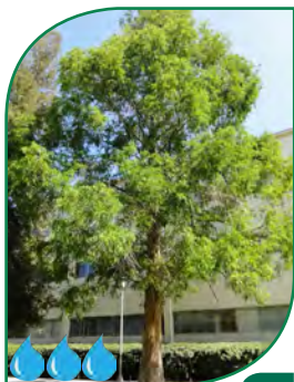
5 Metasequoia glyptostroboides : Dawn Redwood

This fast-growing tree has a straight, single trunk that forms a narrow conical crown and can reach 70-100 ft. They are deciduous conifers with light green feathery leaves and 1/2-1" cones. Dawn Redwoods, native to China, are endangered, and the sole living species in the Metasequoia genus. They are considered a living fossil, around 5 Million years old.