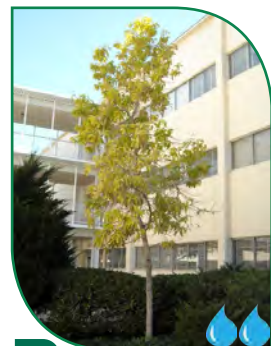
15 Michelia champaca : Banana Shrub

The evergreen Banana Shrub is native to Southeast Asia and India. It has a smooth bark and bright-green, glossy leaves with prominent veins, wavy edges and a finely pointed apex. The heavily scented flowers have 10-20 yellow, orange or cream-colored tepals. The tree was traditionally used to make fragrant hair and massage oils.