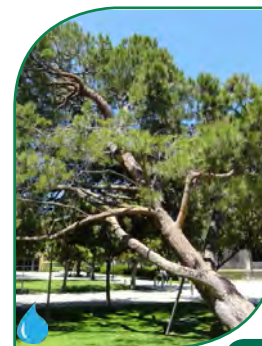
Pinus pinea : Italian Stone Pine 19

This evergreen tree is native to southwest Europe and the Mediterranean. The Italian Stone Pine has thick, deeply fissured bark that is reddish-brown with black edges to the plates. Its green leaves are 2-4" long and needle-like. It grows best in full sun and is very drought tolerant. The seeds inside the cones called pignolia, or pine nuts, can be eaten raw or roasted.