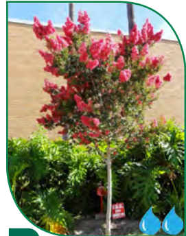
13 Lagerstroemia indica 'Rubra' : Red Crape Myrtle

The deciduous Crape Myrtle, native to India, Southeast Asia, northern Australia and parts of Oceania, grows 10-20 ft in height. The alternate, elliptical to rounded leaves are up to 2.75" long. The young leaves in spring are reddish and the smooth bark comes off in big flakes. Its crimped petals are intense pink to red and bloom from mid-summer to early fall.