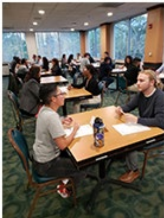
Alumni and students at Speed Mentoring event

On Monday, April 17, 2023, thirteen alumni mentored thirteen students in our first in-person Speed Mentoring event since the pandemic. The event was exciting and lively as resumes were reviewed, cover letters were edited and interview questions answered. The preparation for the students was invaluable. Thank you to