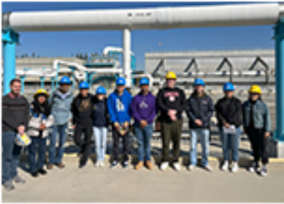
URBS 400 Class visiting Tillman Water Reclamation Plant