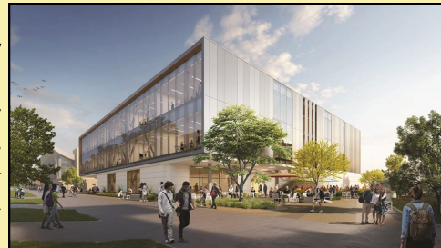
Architect's rendering of the planned Sierra Annex.

The Sierra Annex's opening will clear the way for renovation for Sierra Hall because as classes shift into the new building, there is now more space for renovations to take place in Sierra Hall. Additionally, with more classrooms opening up in Sierra Hall, there are now more spaces that can be used as "swing space" for students. Faculty offices, laboratories, and administrative offices like ours will remain in Sierra Hall. We are excited to see how the Sierra Annex creates new spaces for students to learn and collaborate.