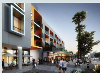
Symphony Northridge Student Apartments

After 50 years of service to the community, the U.S. Post Office on Reseda Blvd., adjacent to CSUN's campus, lost its lease on the property in May 2022 and has been demolished. The property has been purchased by the Symphony Development which plans to add 128 units of new housing. The four-story building will include ground-floor commercial uses, fitness rooms, a swimming pool, a rooftop deck, and a basement parking structure for up to 240 vehicles.