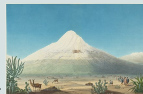
Chimborazo Seen from the Plain of Tapia, Louis Bouquet.

UPSN took a trip to the Getty Museum to see its newest exhibit, "Reinventing the Américas: Construct. Erase. Repeat." This exhibition analyzes representations of the Americas, questioning the mythologies and utopian visions that proliferated after the arrival of Europeans to the continent. It displays views of European chroniclers, illustrators, and printmakers from the 16th-19th centuries and offers diverse perspectives. The exhibition features artistic interventions by Denilson Baniwa, an indigenous contemporary artist from the Amazon region of Brazil and the voices of local community groups in Los Angeles.