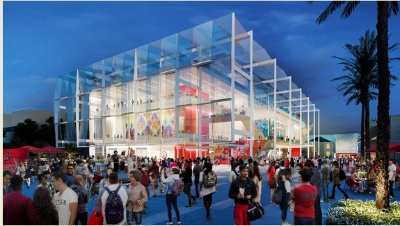
Exterior concept design for the New Heart of Campus at CSUN.

The University Student Union (USU) is being renovated and expanded with a new project that will include the construction of a 79,800 square foot facility and 49,900 square feet of renovated space. The new facility will include increased lounge and study spaces, outdoor shaded seating, enhanced food options, event and meeting spaces, entertainment and gaming spaces and a center for unity in race, intersectionality, social and environmental justice. The renovation will include updating the USU indoor and outdoor areas, meeting rooms, lounge and study spaces, while enhancing the student experience by centralizing student services and improving clubs and organizations' spaces. This new heart of campus will have a positive impact on student success and enhance the quality of life on campus for students and staff.