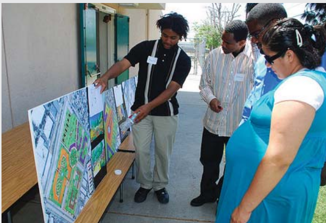
URBS 450 students facilitating community participation at the community workshop utilizing an interactive display.