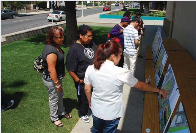
URBS 450 students facilitating community participation at the community workshop utilizing an interactive display.

By organizing a community workshop with 33 community members and conducting 158 interviews, students gathered information as to the specifics of open spaces needed in the area. Once again, working with the department's long standing community partner, Pacoima Beautiful, a final report detailing the process and the outcomes was prepared.