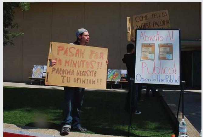
URBS 450 students at the community workshop (in front of Vaughn Charter).