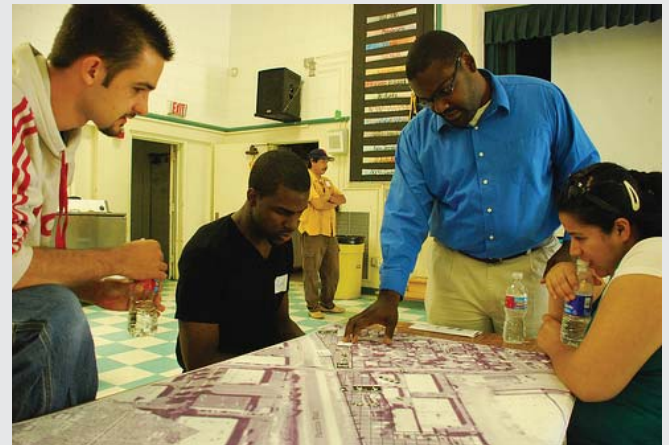
URBS 450 students facilitating community participation at the community workshop utilizing a design game.

This work continued in the spring semester of 2009, when the purpose was to articulate the possible activities preferred and needed in a public open space in the neighborhood as part of URBS 450 Urban Problems Seminar.