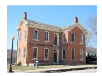
Fig. 5-5 Gable front