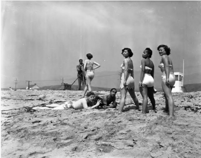
California School of Photography, Los Angeles, 1950