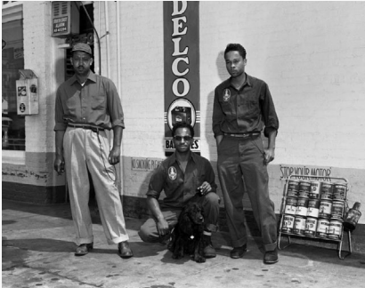
Gas Station Workers, Los Angeles 1955