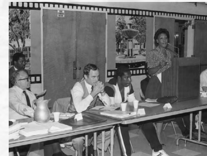
Community Panel, Los Angeles 1984