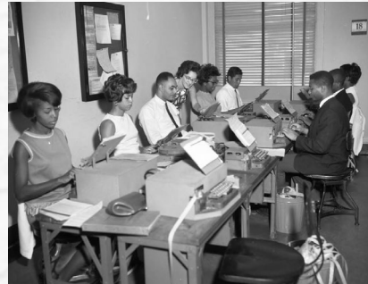
Western Union, Los Angeles CA 1965