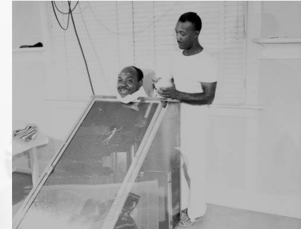
Roy Milton, Los Angeles 1965