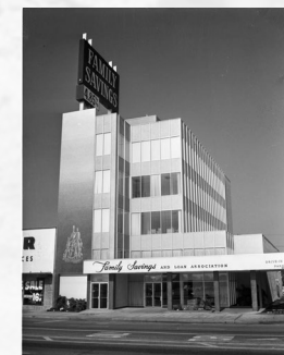
Family Savings and Loan, Los Angeles, 1963