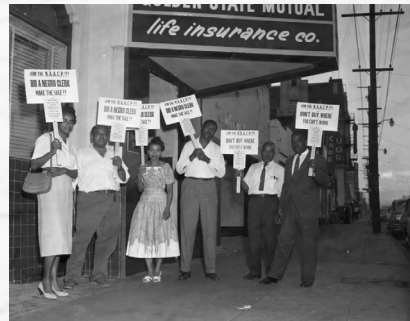
Protest, Los Angeles 1957