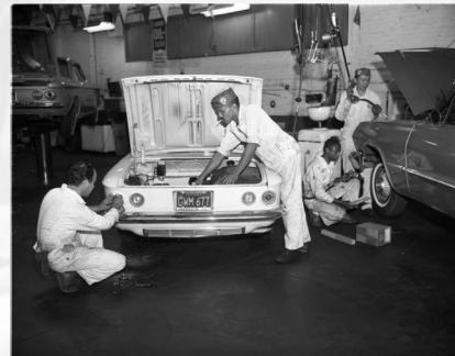
Arrow Chevrolet, Los Angeles, 1963