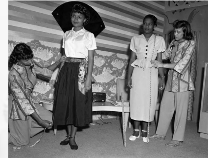
Child's Festival, Los Angeles, 1948