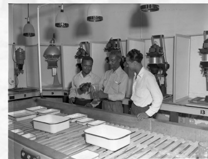
California School of Photography, Los Angeles, 1947