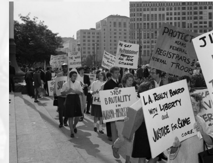
C.O.R.E., Los Angeles 1965