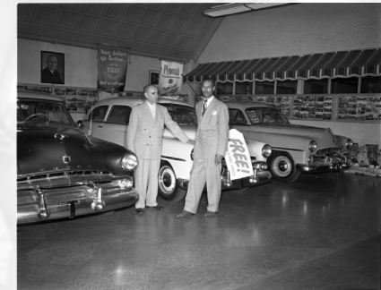
Auto Showroom, Los Angeles, 1960