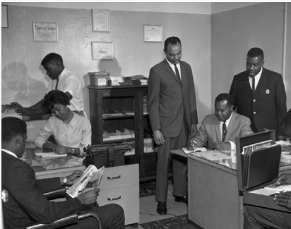
Arrow Chevrolet, Los Angeles, 1963