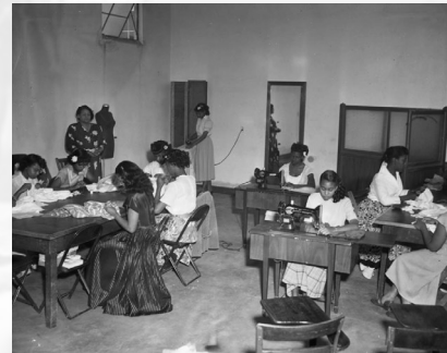
LA Academy, Los Angeles 1950