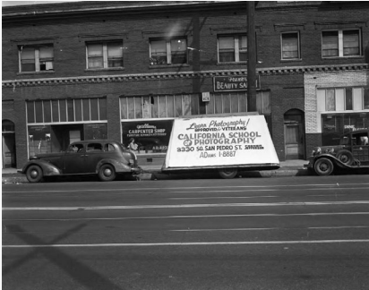
Advertisement, Los Angeles, 1950