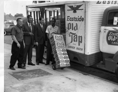
Cotton Boys, Los Angeles, 1962