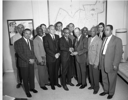
Central Chamber of Commerce, Los Angeles, 1967