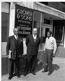
Design School, Los Angeles, 1949