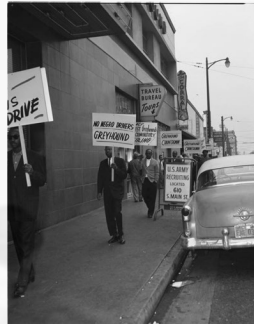
Greyhound Pickets, Los Angeles 1961