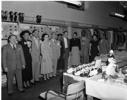
Clothing Store, Los Angeles, 1949