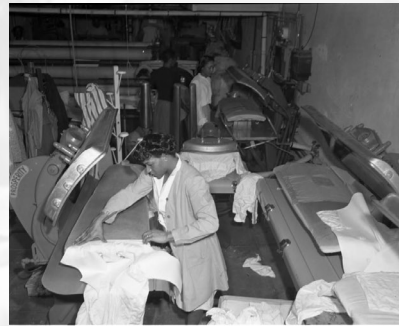
Towel Service, Los Angeles 1950