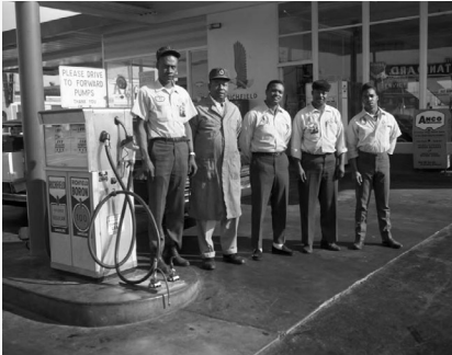
Richfield Oil Company, Los Angeles 1967