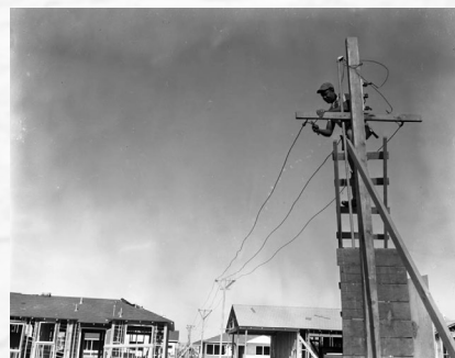
Electricians, Los Angeles, 1948