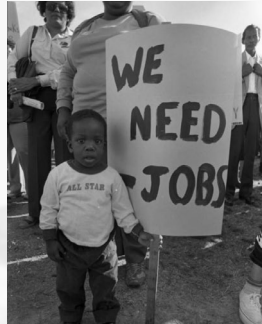
Child Holding Sign, Los Angeles 1983