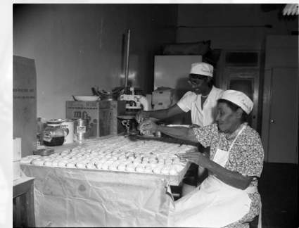
Crown Flour, Los Angeles, 1957