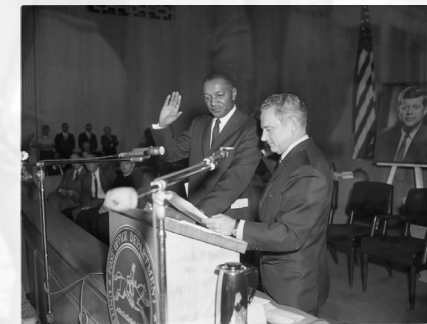
Les Shaw First Negro Postmaster, Los Angeles