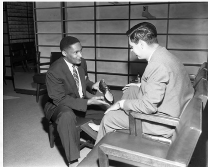
Salesman, Los Angeles 1957