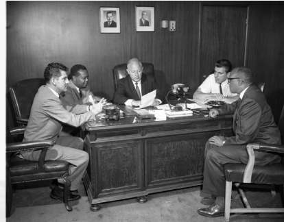
Arrow Chevrolet, Los Angeles, 1963