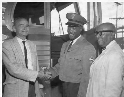
Negro Bus Driver, Los Angeles 1962