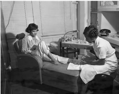
Johnsons Bath House, Los Angeles CA 1965