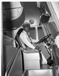
Bus Driver, Los Angeles, 1962