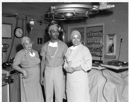
Avalon Hospital, Los Angeles, 1962