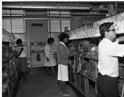
Western Union, Los Angeles CA 1960