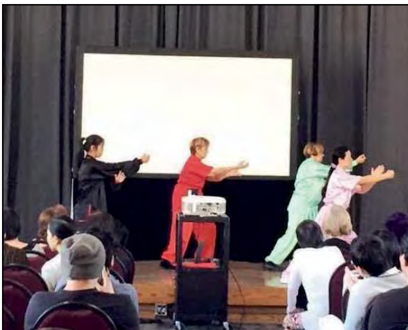
Tai chi presentation in the USU Grand Salon, November 24.