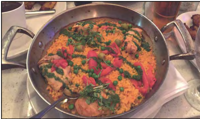
A new favorite—arroz con pollo.

Workshops and presentations were designed to inform students about internship and employment opportunities during and after their careers in higher education. There was a breadth of federal and private agencies in attendance. As an English major, I had feared that there might be few opportunities tailored to my educational and career goals. However, I was delighted to see that every major had opportunities available. This exemplifies HACU's efforts to promote the presence of Hispanic-Latino students in as many fields as possible.