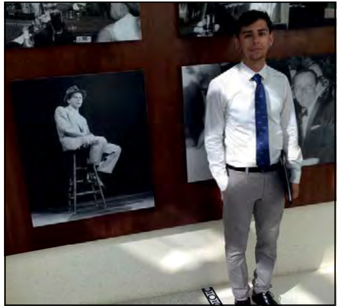
At the Fontainebleau.

time passes. When I first saw that shadowy feline with moon-like eyes at the Flyaway I considered it to be an ill omen, an oracle foreshadowing the quality of my trip. However, in retrospect perhaps this shadowy visitor was the exact opposite. Perhaps its appearance was an omen, but if it was, it certainly wasn't an ill one.