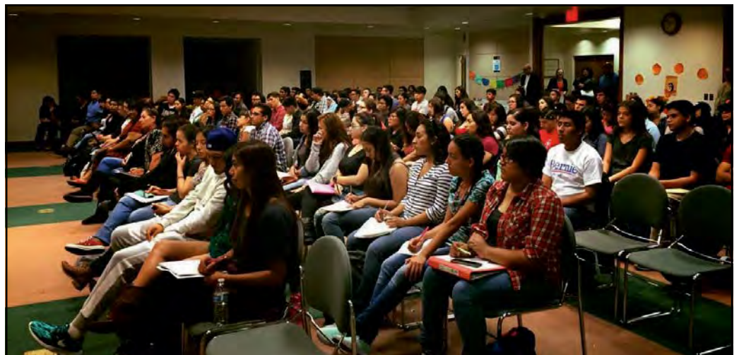
Students attending: "Words About Día de los Muertos: Indigenous Perspective," in Ferman Presentation Room, Oviatt Library.

The Department of Chicana/o Studies at CSUN has celebrated Día de los Muertos for over 30 years. The events have grown over the years from a small celebration hosted by a few faculty members in one of the classrooms in Jerome Richfield Hall, to a campus-wide effort that is attended by the extended CSUN family. Currently, events take place at the Chicana/o House Cultural Center and are organized by several members of the campus community. This year, Día de los Muertos events were planned through collaborative efforts by the student-led organization MEChA ( Movimiento Estudiantil Chicano de Aztlan ), faculty in the Department of Chicana/o Studies, and Oviatt librarians, who included event programming as part of a grant from the National Endowment for the Humanities and the American Library Association. Día de los Muertos on the CSUN campus is a festive and solemn celebration that builds community by bringing together people from diverse academic, geographic, and cultural backgrounds to enjoy lectures, food, and exhibits made possible by dedicated members of this campus.