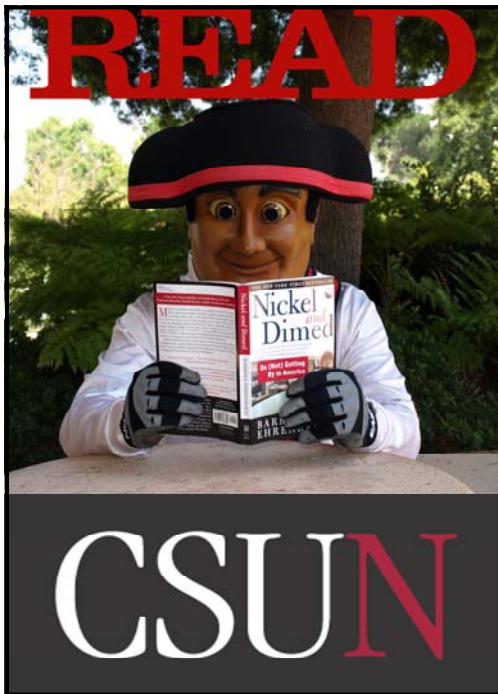
CSUN Mascot, Matty the Matador, reading Nickel and Dimed .