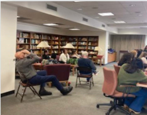
Attendees of the celebration event