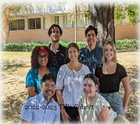
2022-2023 TIPs Cohort