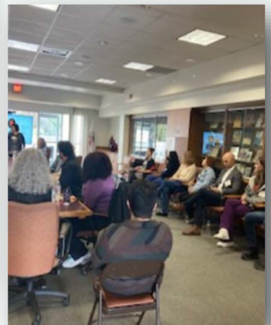
Attendees of the celebration event