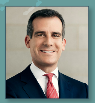
Mayor Eric Garcetti City of Los Angeles