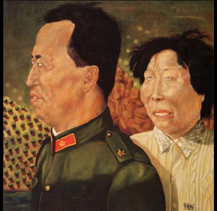
Liu Wei, The Revolutionary Family series , 1990.