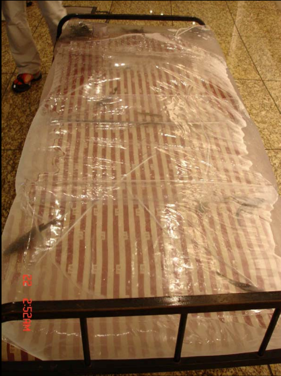
Shen Yuan, Fish Bed , 1989.