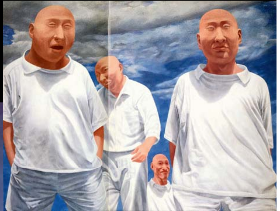
Fang Lijun, Series II , 1992.