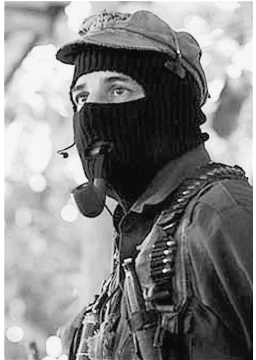
1. Subcomandante Marcos smoking his famous pipe in Mexico City, D.F., March 2001.