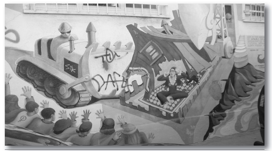
Figure 1. "The People of Venice versus the Developers" (the Venetian spray-painting the words "STOP THE PIG" not seen, left)

n a quiet side street in Venice, California, three blocks from the bustling Ocean Front Walk, a mural that few tourists are likely to see offers a bitter commentary on the historic-geographic dynamics of the landscape they have come to visit (Figure 1). This is the landscape of Los Angeles' "first" public park, the beach. Painted in 1975 (and re-furbished in 1997 by the community-based arts center SPARC (Social and Public Art Resource Center), the now graffiti-covered mural portrays a bulldozer and an excavator demolishing a simple, shore-adjacent cottage. As the house collapses a woman is revealed sitting cross-legged on the floor inside, making the viewer not only witness to a scene of violence but also an inadvertent peeping tom. The woman clutches her blue-scarfed head in fear and bewilderment while her cat leaps for safety. In the left foreground a group of Venetians protests the demolition, one by spray painting "Stop the PIG!" on a wall. "The People of Venice vs. the Developers" was painted when both property condemnations by the city and gentrification had begun to force out