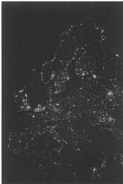
Figure 1. “Europe at Night,” in which modern settlements appear as pin pricks of light.

This paper, which divides into six parts, reports preliminary research on the empirical groundwork required for describing the new metageography of relations between world cities. Such a modest goal is made necessary because of a critical empirical deficit within the world-city literature on intercity relations. In the first part, we show this to be a generic problem across all the different research schools within the literature. By concentrating on the attributes of world cities and neglecting their relations, we learn a lot about the nodes in the network, but relatively little about the network itself. In a brief second part, we introduce Castell’s concept of network society, in which the world-city network does feature, and although this provides a conceptual framework for our research, the empirical problematic remains. Our particular solution to this data problem is to focus on the global office-location strategies of major corporate-service firms; in the third part, we outline this