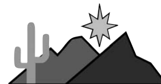
Starr Pass Golf Club

Dial extension 6028 to book your treatment today.