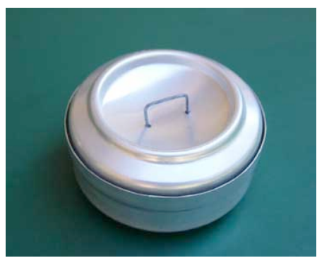
The top/base can be used as a cover for storage or to seal the stove and save fuel between meals. I now use the bottom of a pop can with one 1/16" hole in the bottom- it's lighter and fits tight without getting stuck - no need for the handle. Simmer ring slips over the bottom (not shown in this photo). The package is small enough to store inside of a plastic camp cup.