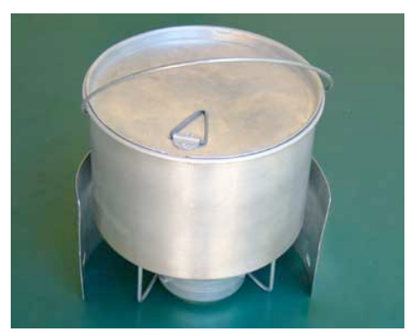
Modefied 2 quart Open Country pot (6oz.) is large enough to melt snow, sterilize water, wash clothes, or shampoo hair. The stove, support, and screen fit inside the pot (total 8.3oz). An 8oz. bottle of alcohol (about 12 fully cooked meals) fits inside along with a spork, cup, scrub pad, soap, matches, lighter, salt, pepper, coffee, tea, and towel. Total cook kit is less than 20oz.