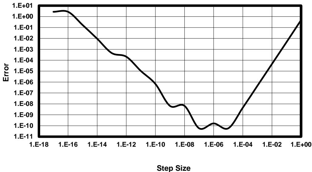
Figure 1. Effect of Step Size on Error

Equation [27] shows that the order of the error is just the slope of a \log(\text{error}) versus \log(h) plot. If we take the slope of the straight-line region on the right of Figure 2-1, we get a value of approximately two for the slope, confirming the second order error for the central difference expression that we are using here. However, we also see that as the step size reaches about 10^{-5} , the error starts to level off and then increase. At very small step sizes the numerator of the finite-difference expression becomes zero on a computer and the error is just the exact value of the derivative.