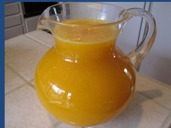
pulpy orange juice