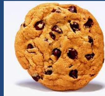
chocolate chip cookie

Heterogeneous mixture – multiple phases, variable composition throughout