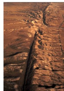
San Andreas Fault

Geology incorporates traditional concepts in chemistry, mathematics, and physics applied to the study of mineral compositions and physical tectonic processes. Material covered in this course is presented at a level appropriate for a college freshman who is not a science major.