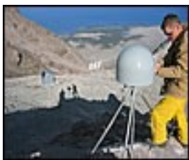
GPS receiver installation

Professional geologists in industry, education, and research are particularly active in the state of California. This course will give you an overview of some of these fields including environmental science, engineering geology, hydrogeology, atmosphere and oceanographic science, earthquake geology and geophysics