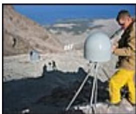
GPS receiver installation

Professional geologists in industry, education, and research are particularly active in the state of California. This course will give you an overview of some of these fields including environmental science, engineering geology, hydrogeology, atmosphere and oceanographic science, earthquake geology and geophysics