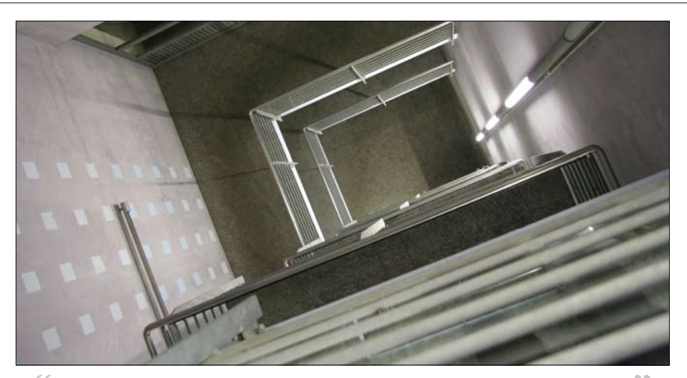
66 Make people aware of the stair options. For example, hang signs by the elevators saying, 'Have you thought of taking the stairs today?' 🍤

Infrared Sensors. For the CDC "StairWELL to Better Health" intervention, infrared beam sensors were installed to collect baseline data and conduct ongoing data collection of stair traffic. These proximity sensors were placed at each of the floors' stairwell entries and recorded one passage when a person moved between a transmitter and receiver. Therefore, each trip in a stairwell involved two passages, one to enter the stairwell and one to exit. Information from the sensor is downloaded onto a computer and reports can be generated. Whereas direct observation may be able to measure whether an individual is going up or coming down a stairwell, infrared sensors