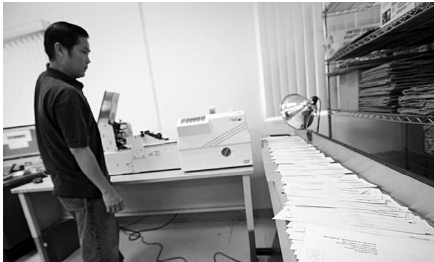
CSUN Postal and Delivery Services employee sorts mail.