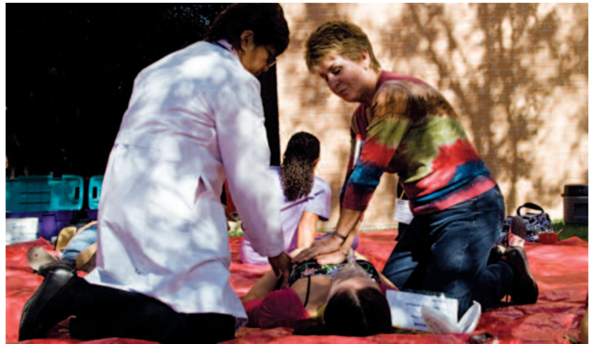
Medical professionals at Cal State Northridge's Klotz Student Health Center simulate their response to a magnitude-7.8 earthquake as part of the Great Southern California ShakeOut earthquake drill on Thursday, Nov. 13. The university was among more than 5 million schools, businesses and individuals to participate in what has been dubbed the largest earthquake drill in U.S. history. CSUN's Department of Public Safety notified employees of the drill via the campus office phone messaging system and instructed them to "Drop, Cover and Hold" as part of the drill.