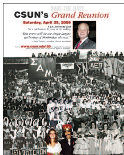
Grand Reunion Ad

To organize a reunion group or to volunteer, contact Alumni Relations at alumni@csun.edu . For more information or to register, visit www.csun.edu/50 or call Alumni Relations at (818) 677-2137. ■