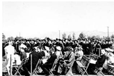
Inauguration of first president of San Fernando Valley State College