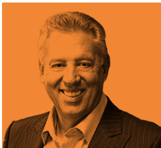
JOHN C. MAXWELL Leadership expert, bestselling author, and coach