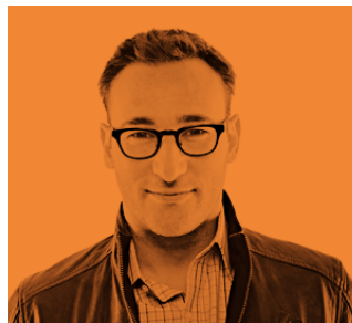
SIMON SINEK Optimist and author, leadership authority