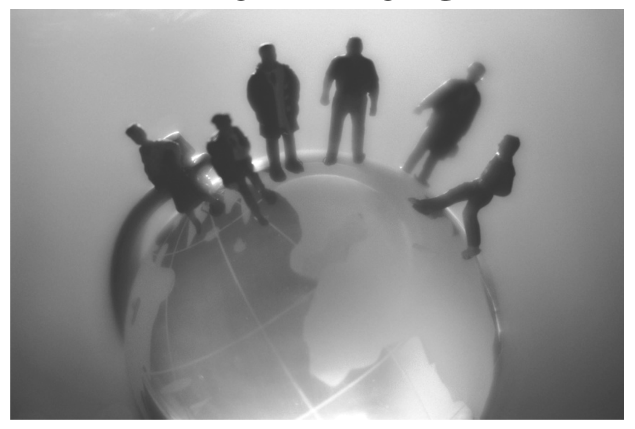
The People Profession