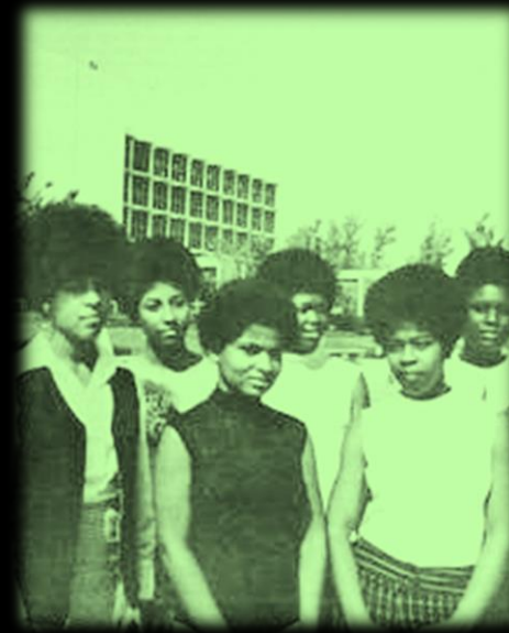
CSUN BSU 1968