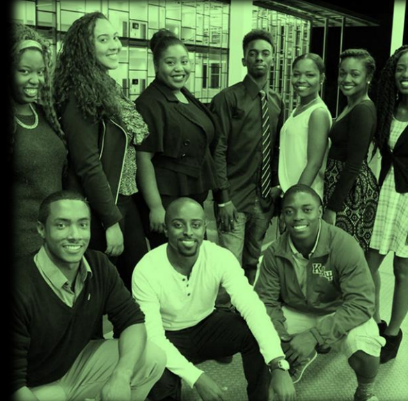
CSUN BSU 2015