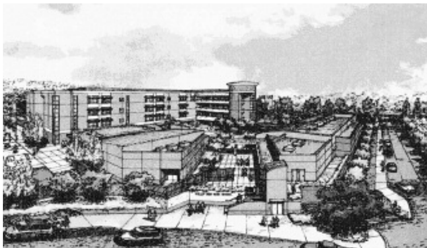
Architect's rendering of the Academy High School project, looking toward Zelzah Ave.