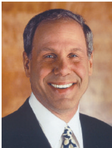
Michael D. Eisner, chairman and CEO of The Walt Disney Co.

opportunity to succeed. Yet in schools across the nation, children with learning differences are often underserved in traditional classroom settings," said Michael Eisner, chairman and CEO of The Walt Disney Co.