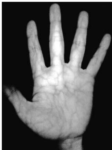
Scan of a palm's vein pattern

About 4,000 business programs at 1,800 universities, including most top-ranked institutions, require the GMAT for admission. The business-school council gives 230,000 GMAT tests annually and says it won't raise the exam's $250 price. Japan's Fujitsu Ltd., which makes the scanners, says the device typically costs $1,000 or less. Including training, installation and other costs, London's Pearson PLC, which administers the business-school test for the council, expects to spend millions on the rollout of the vein-scanning technology at more than 450 test centers.