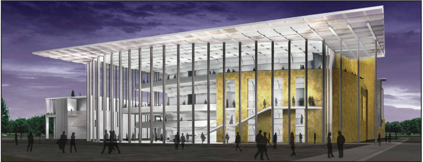
FIGURE 1. Artist's rendering of the west façade of the Valley Performing Arts Center main lobby.

tainable concepts. Part of the sustainable design strategy for the heating water plant included the installation of two hydrogen fuel cells that provide clean electricity to the campus grid. A byproduct of operating fuel cells is a substantial amount of heat that can either be wasted, or, as is the case at this campus, recovered and put to good use.