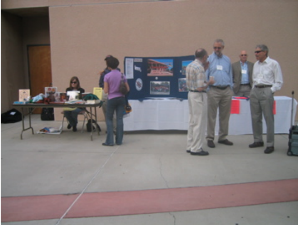
Exhibitors provide students with information about their organization.