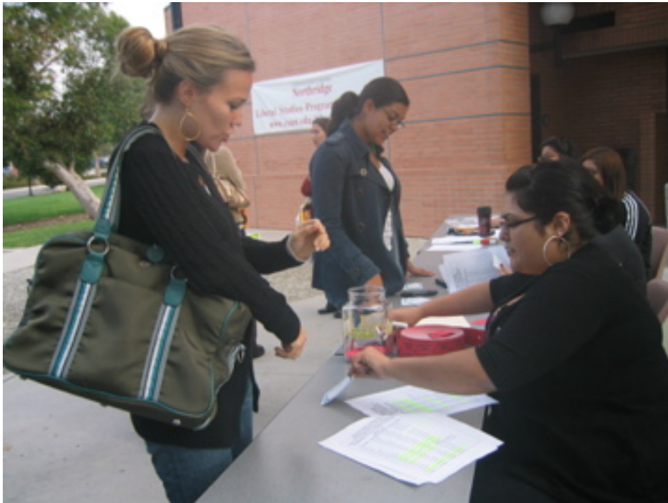
Liberal Studies students check-in at the conference.

Below are some of the conference pictures. Please check your CSUN email account and the Liberal Studies website for our future events.