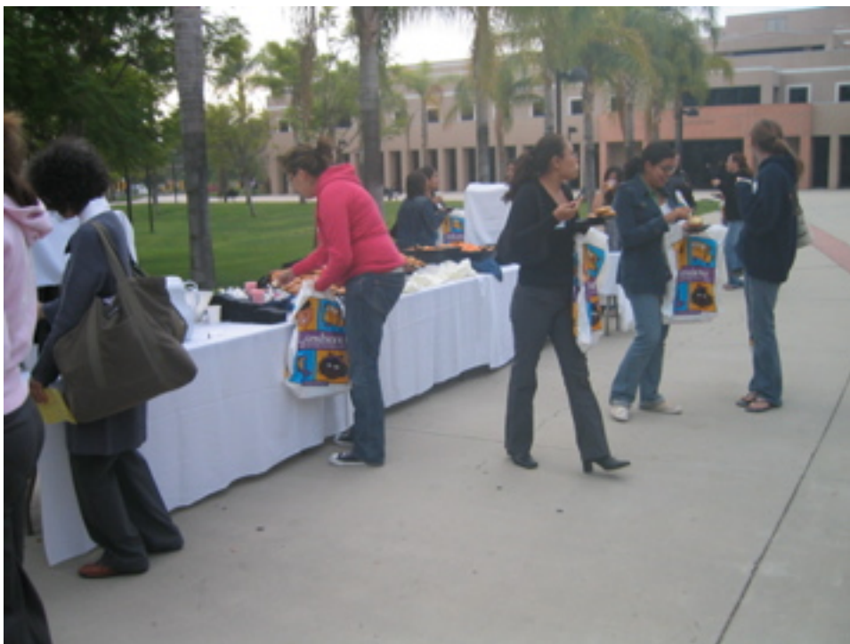
Students enjoy a continental breakfast.