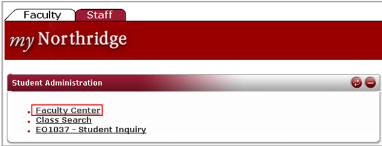
Figure 2 – Faculty Center Link

5. On the Faculty tab, from the Student Administration pagelet, select Faculty Center .