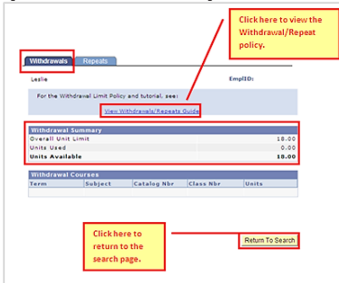
Figure 5 – Withdrawals Tab and Page