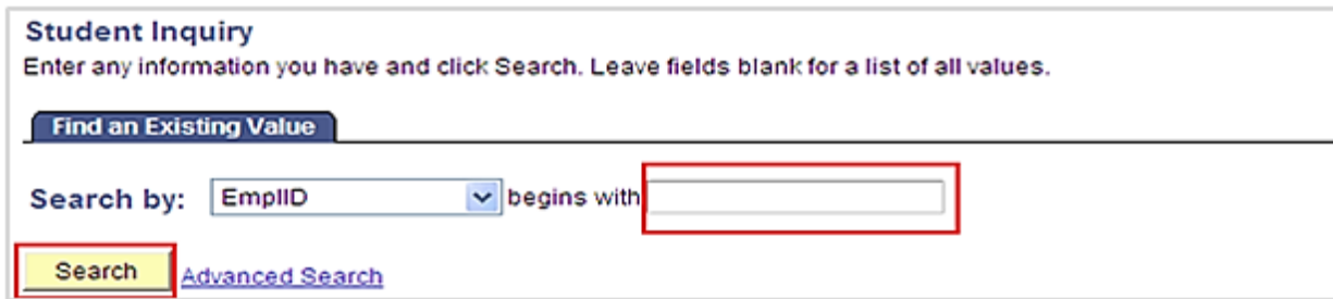
Figure 4 – Find an Existing Value Search Screen