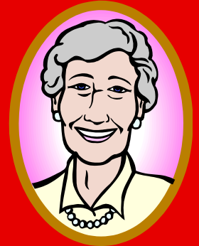
Learn Life Lessons with the elderly!