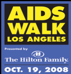
AIDS WALK Oct. 19