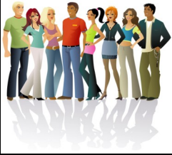
CSUN 2008 EXPO!