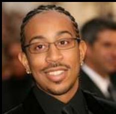
Big Show 8 Staring Ludacris

Since the beginning of the epidemic, AIDS Project Los Angeles has provided comprehensive HIV risk reduction and health education to people living with HIV disease and to those at risk for HIV infection. APLA's HIV prevention work includes community organizing, peer health education, research and evaluation, and HIV prevention leadership through summits, conferences, trainings, publications and social marketing campaigns. Come out and walk with Team CSUN 003 on October 19. You can register today at www.aidswalk.net/losangeles or contact the MIC at 818-677-5111 and transportation and breakfast will be provided.