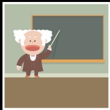
Improve your Resume!