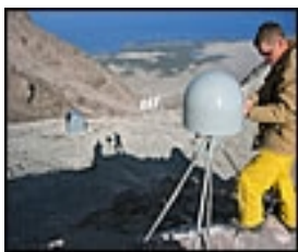
GPS receiver installation

Professional geologists in industry, education, and research are particularly active in the state of California. This course will give you an overview of some of these fields including environmental science, engineering geology, hydrogeology, atmosphere and oceanographic science, earthquake geology and geophysics