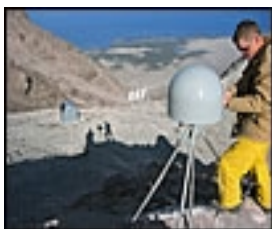
GPS receiver installation

Professional geologists in industry, education, and research are particularly active in the state of California. This course will give you an overview of some of these fields including environmental science, engineering geology, hydrogeology, atmosphere and oceanographic science, earthquake geology and geophysics