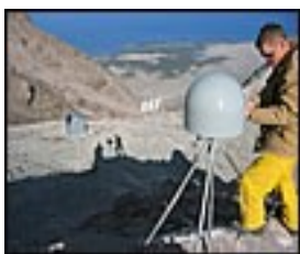
GPS receiver installation

Professional geologists in industry, education, and research are particularly active in the state of California. This course will give you an overview of some of these fields including environmental science, engineering geology, hydrogeology, atmosphere and oceanographic science, earthquake geology and geophysics