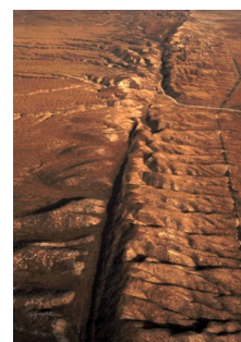
San Andreas Fault

Geology incorporates traditional concepts in chemistry, mathematics, and physics applied to the study of mineral compositions and physical tectonic processes. Material covered in this course is presented at a level appropriate for a college freshman who is not a science major.